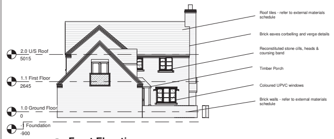
3 Front Elevation 1: 100