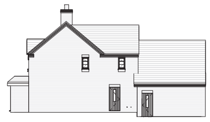
5 Side Elevation 1: 100