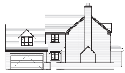
6 Side Elevation 2 1: 100