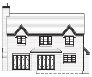
4 Rear Elevation 1: 100